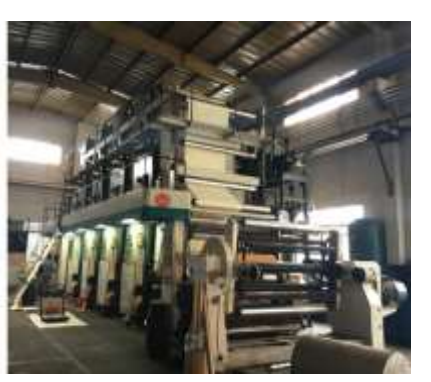
MORE NATURE 以更自然